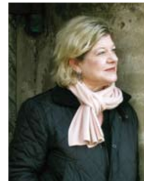
Marta Fry Landscape Associates

Atelier Vierkant is honored to collaborate with such a large number of architects. In this magazine we present five female landscape architects with their work, their way of designing a space, a garden, a terrace. Some of their projects require a particular shape, a special form that goes beyond the lines of the standard collection. In collaboration, we create new forms often used as anchoring elements in the project. Architects are welcome in our atelier to discuss the design for a particular project, to develop the right form and to finalize the prototype into the required shape. They are and will always be a fundamental source of inspiration in our work.