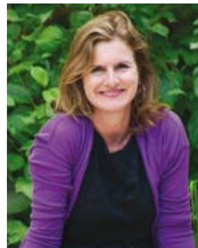
Charlotte Rowe Garden Design